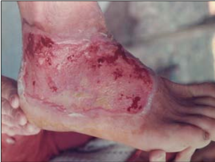
Before the treatment